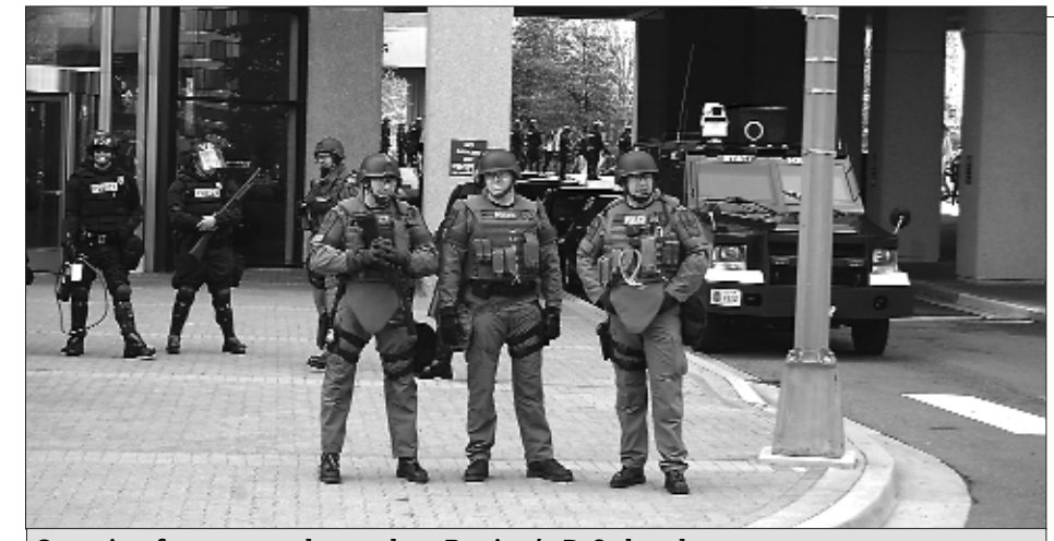
Security forces stand guard at Boeing's D.C. headquarters