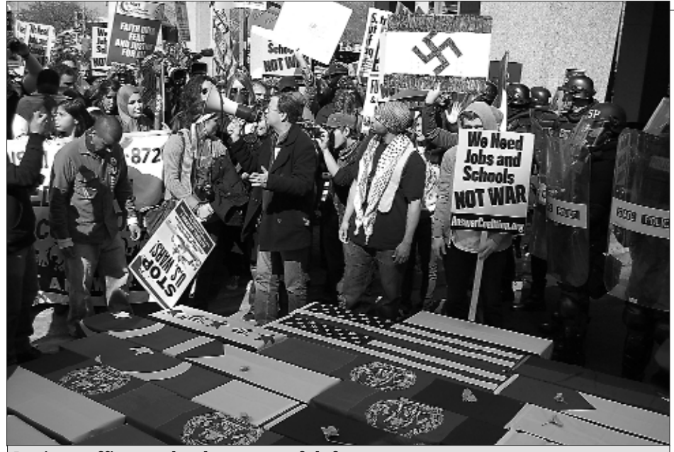
Laying coffins at the doorsteps of defense contractors