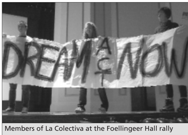
Members of La Colectiva at the Foellinger Hall rally