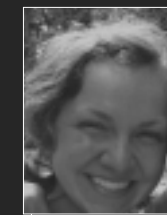
Voices Rise for the DREAM Act Celeste Larkin Page 1