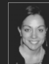
Reitz's Finding in the Kiwane Shooting Kerry Pimblott Page 3