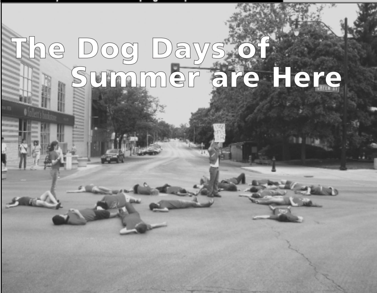
Students staging a 'die-in' against the Iraq War in the intersection of Green and Wright Streets in Campustown.

A Paper of the People JUNE/JULY 2007 V7 #5