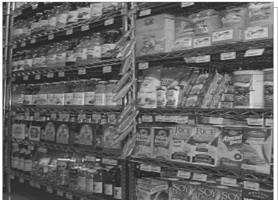
Shelves of packaged organic foods

The new co-op will be over twice the size of its current shop. Features will include over 48 feet of organic produce cases and shelves, making the co-op's produce department the largest exclusively organic and local produce department in Champaign County. A new deli department is being added after receiving huge demand from current co-op owners and community members. The deli will feature local ingredients whenever possible and will have a cold salad bar, hot foods case, three fresh soups every day, a full grab and go case, as well as fair trade organic coffees. Lincoln Square has generously donated the use of indoor seating space exclusively for the use of co-op deli diners as well as an outdoor seating area just outside the co-op's front door, providing a space not only for dining but to build community.