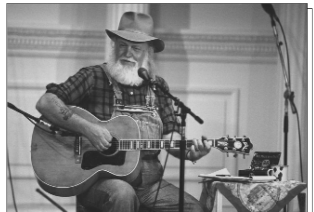
U. Utah Phillips