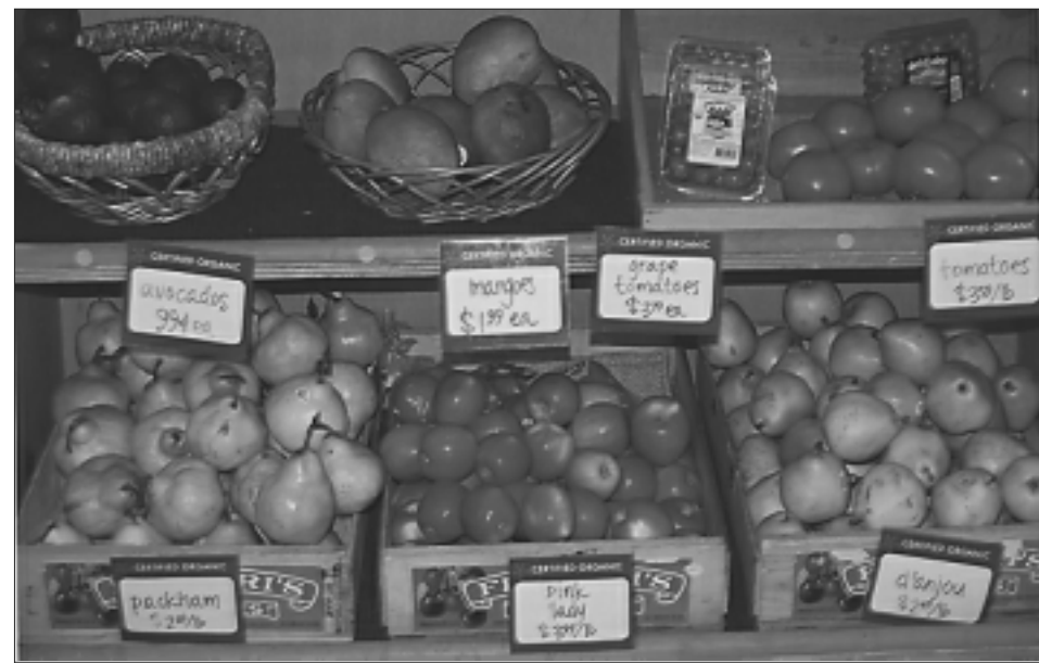
Fresh organic fruit

The groundswell of public support has been amazing throughout the project. Common Ground's member-owners personally pledged over $250,000 in direct loans to the co-op to make the new store a reality, more than any other co-op Common Ground's size has ever raised. New members have been pouring in, and investments in and support for the project has come from numerous public and political figures in Champaign-Urbana.