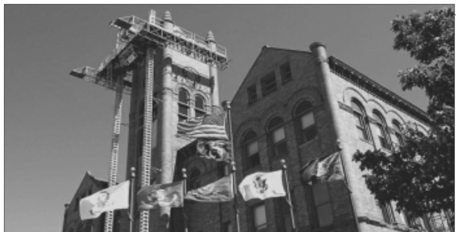
The Champaign County Court House clock tower restoration

Although a variety of worthy proposals were presented by area residents to the County Board prior to their decision, it seems that again property—the Courthouse and Clock Tower in this instance—are the priority for community officials, rather than the needs of disenfranchised people in this community, who bare the brunt of government neglect.