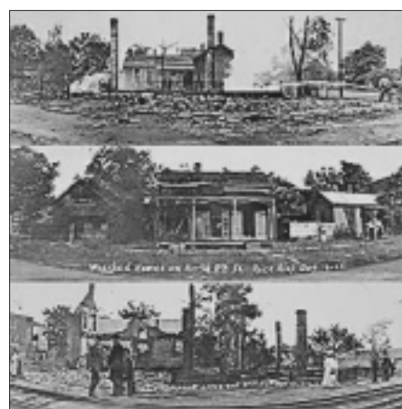
Old photos of the aftermath of the Race Riots of 1908

Something So Horrible: Springfield Race Riot of 1908 will illustrate how racism and political corruption undermined law and order and set the stage for mob rule. The exhibit will also show how an event of one hundred years ago lives in both the historical record of the past and the racial divisions that continue to confound us.