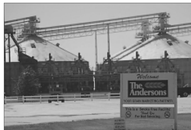
The Andersons grain facility

Whether or not biofuels are the answer to our energy problems is a question outside the scope of this article. Regardless, The Andersons plant plans to withdraw 1.9 million gallons per day of pristine aquifer water to use for evaporative cooling. This would not have an immediate effect on the quality of water in the Mahomet Aquifer. But as well-reported by the News-Gazette , it most certainly would have an effect on the quality of water in the