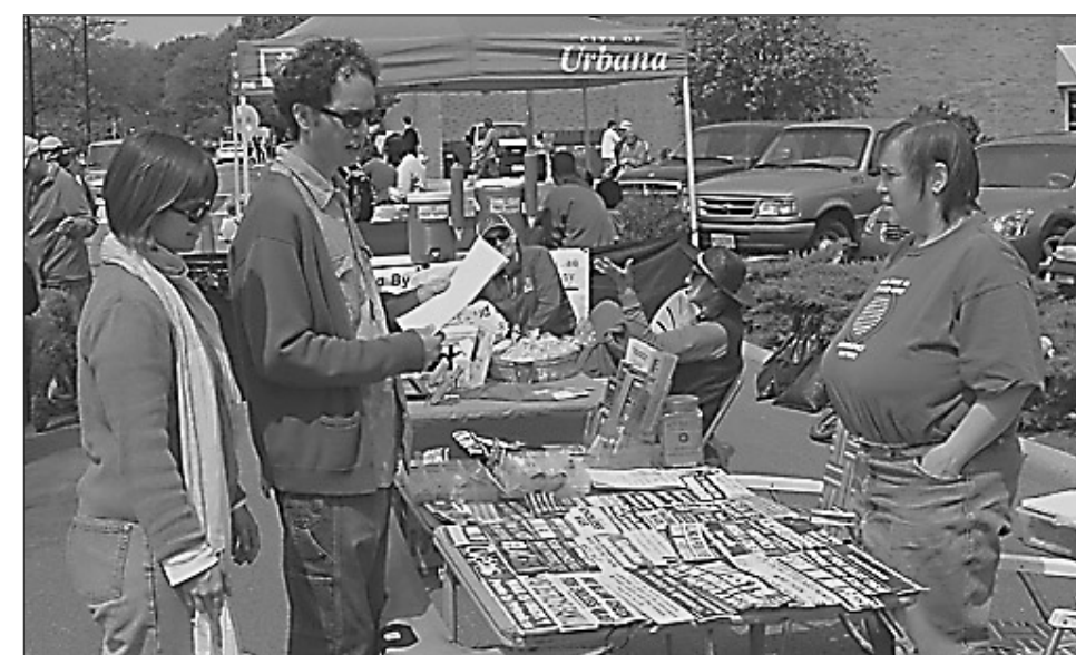
Community organizations doing outreach