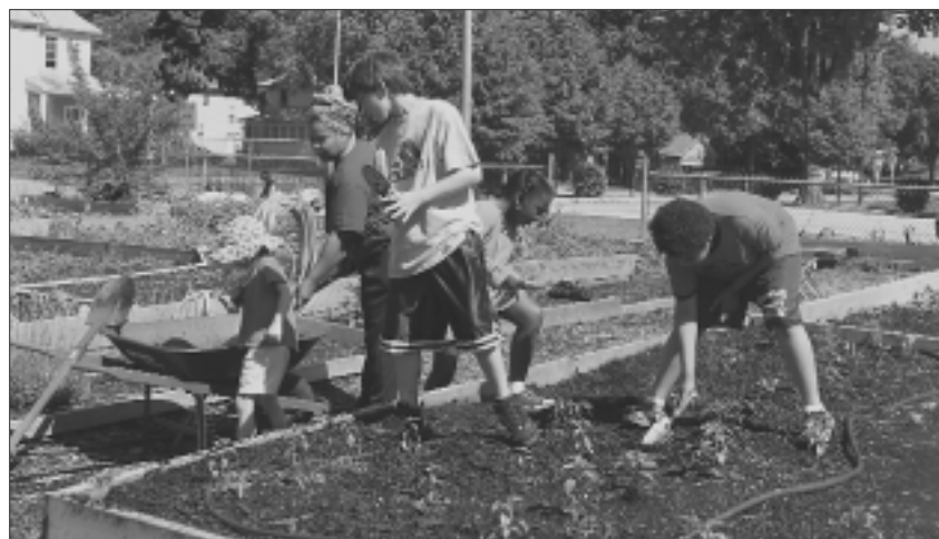
Community member at work in the garden

ence the feasibility of growing food in an urban setting, learn how to grow and harvest a variety of nutritious and culturally diverse edibles, and try to improvise various