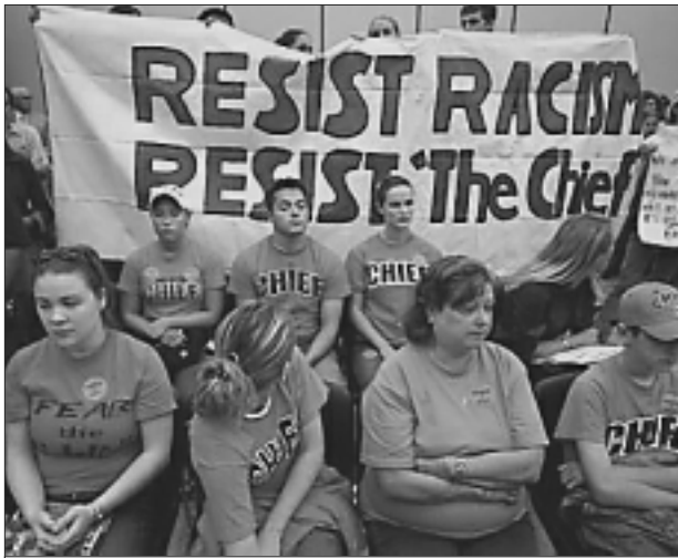
Protest against 'Chief Illiniwek'

als of themselves and their ancestors, they can just leave the game, turn their backs, or turn off the TVs or switch channels. What such individuals fail to realize is that a people that historically has been subjected to genocide cannot just turn it off. Once the images are seen, or once they have the knowledge that others are being presented such images, the hurt is there and it stays there. Moreover, it is not just the hurt caused by remembering the past genocidal killings, but the thought that the killings could