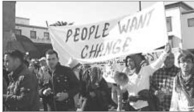
Defiant demonstrators seeking democracy send a clear message against state repression and police violence