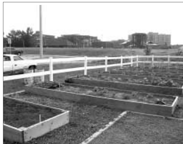
The prosperity garden on 1st Street

Prosperity Garden is to expand the horizons of participants. Bridge noted that the participants have been doing a good job of both weeding and mulching the garden. Organizers and participants in the Prosperity Garden hope to start selling fresh produce at the market as it becomes available. Next to the garden, a structure is being built which will offer cooking classes and demonstrations to market patrons and members of the Boys and Girls club. It is expected that construction will be complete before the current season ends.