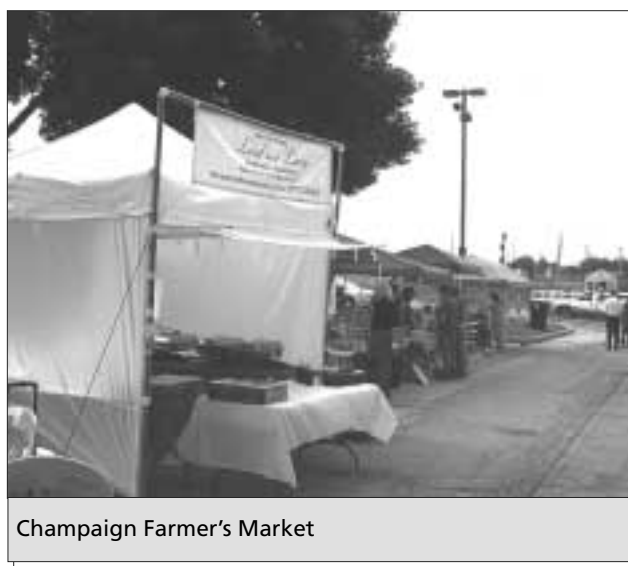
Champaign Farmer's Market