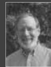
Unemployment In CU David Green Page 1